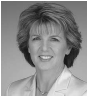
Hon Julie Bishop

Here's an event for the whole of Australia's Harvard community, and anyone who connects with it - a gala dinner to celebrate the many years of 'learned exchange' between Harvard University and Australia. In particular, the gathering will honour participants in the newest venture of the Harvard Club of Australia Foundation which is dedicated to this objective.