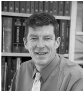
Professor Ian Frazer

The dinner, to be held in the State Room at the new Hilton Sydney on Wednesday 5th April, is expected to draw many of the prominent Australians who gained at least part of their education at Harvard University or who taught or did research there. The theme of the night is "Excellence in Science: growing Australia's rich talents".